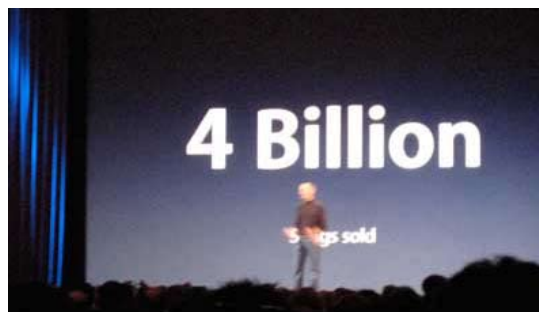
Macworld Expo 2008 Keynote – Steve Jobs reports sales of a staggering 4 billion iTunes songs.

Visit MUG ONE's web site at http://www.mugone.com