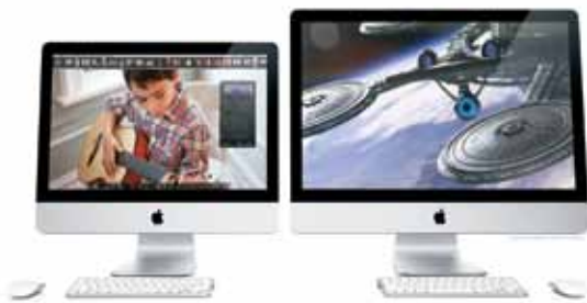
The new 21.5” and 27” iMacs with backlit LED screens

She then gave us an overview of Apple’s October 20 introduction of new 21” and 27” iMacs starting at $1199 and $1699, respectively, a 27” quad core iMac for $1999, and