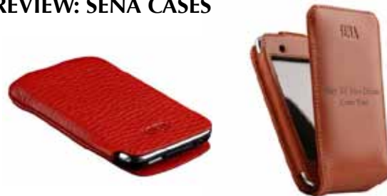
UltraSlim Pouch MagnetFlipper, monogrammed