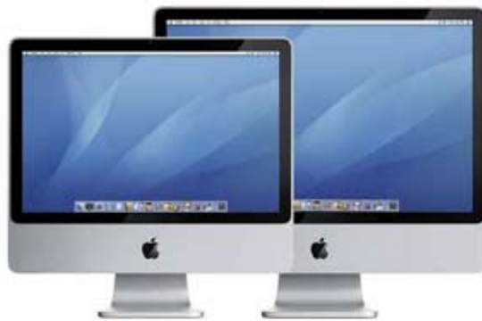
Elegant new iMacs come with 20" and 24" screens

Visit MUG ONE's web site at http://www.mugone.com