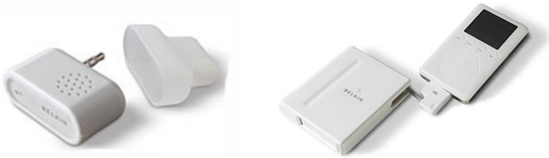
The Belkin Voice Recorder, $49, and Media Reader, $99