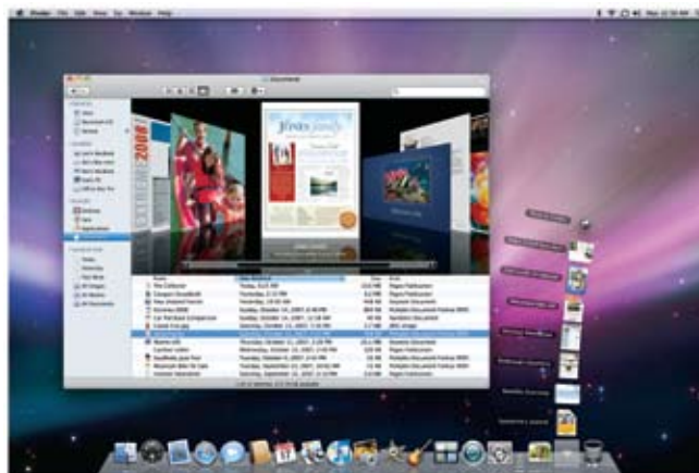
Stacks, a feature of OS 10.5 Leopard, organizes files in the Dock for easy access.

Visit MUG ONE's web site at http://www.mugone.com