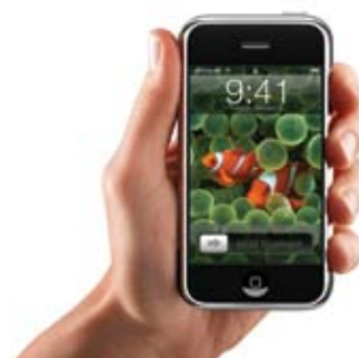
The Apple iPhone is scheduled to arrive on June 29

Visit MUG ONE's web site at http://www.mugone.com