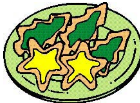
Bring holiday goodies to share at our Dec. 6 meeting

Visit MUG ONE's web site at http://www.mugone.com